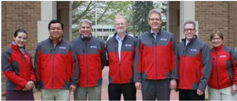
Department of Religion and Biblical Languages professors gathering outside Buller Hall.

AROUND 100 STUDENTS major in either Theology or one of the tracks for a BA in Religion at Andrews. For some years the department has managed to maintain this number in spite of general challenges in student numbers. Also this year our student body is international. Among our May 2016 graduates we count students from Norway, Tanzania, Haiti, and we have served students from Chile, Brazil, Papua New Guinea, Mexico etc., alongside a broad and diverse representation from within the United States.