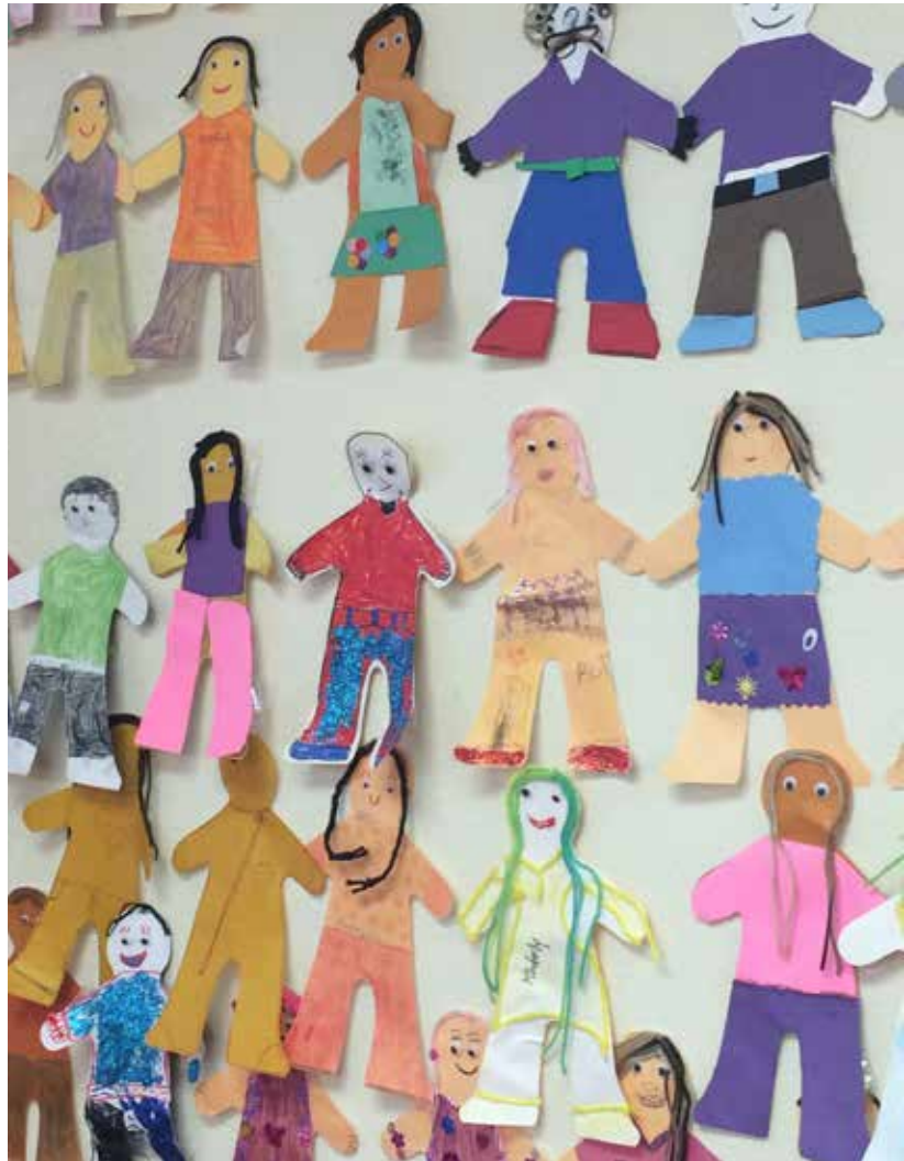
Paper dolls created by refugee children