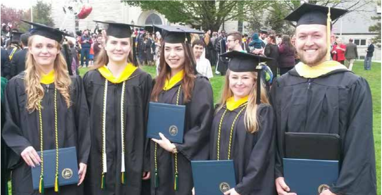
A group of Agriculture Department graduates, May 2016.