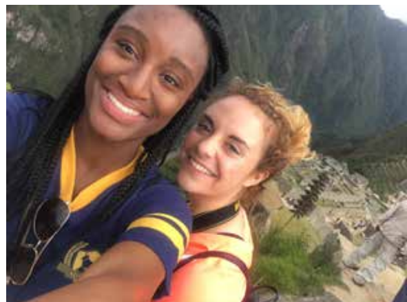
Students enjoying the 2016 study tour.