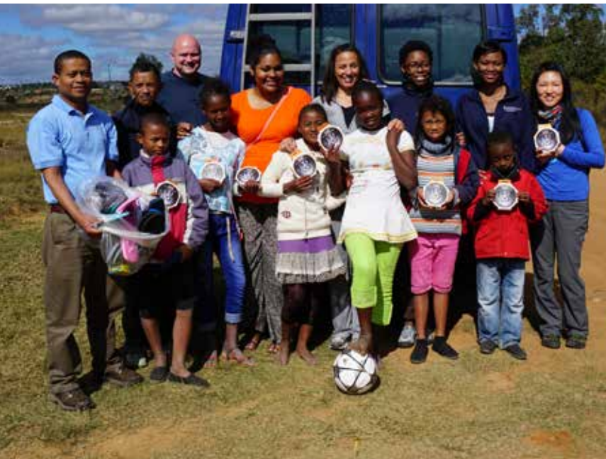
CIDP Study tour students delivered solar lamps a football and some new flip flops to students at a local orphanage in Madagascar.

We are grateful for the many opportunities our students are able to experience, and especially grateful to those who have donated to our projects. The work that is completed does not end in Madagascar, and many of our students return to continue developing their own projects.