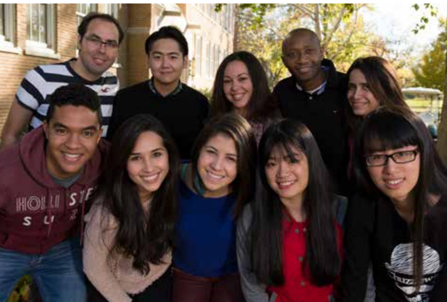
A cohort of CIEP ESL students from Brazil, China, South Korea, and Venezuela enjoy the autumn weather on the Andrews University campus.