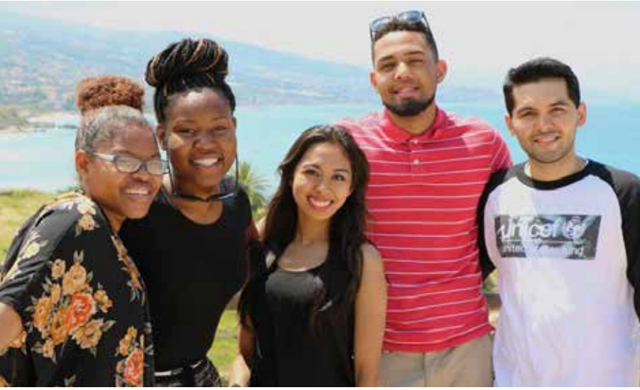
Students take a photo at one of the scenic views on the 2015-16 religion study tour.