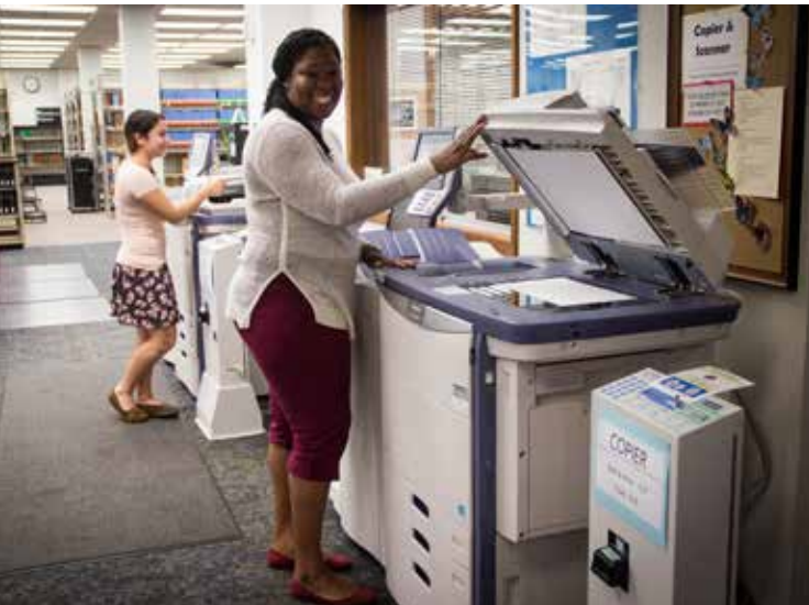
The new copiers and printers available at the James White Library are faster and easier to use.