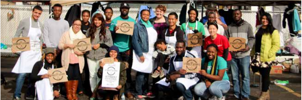
Volunteers in front of the Benton Harbor pop up street store.